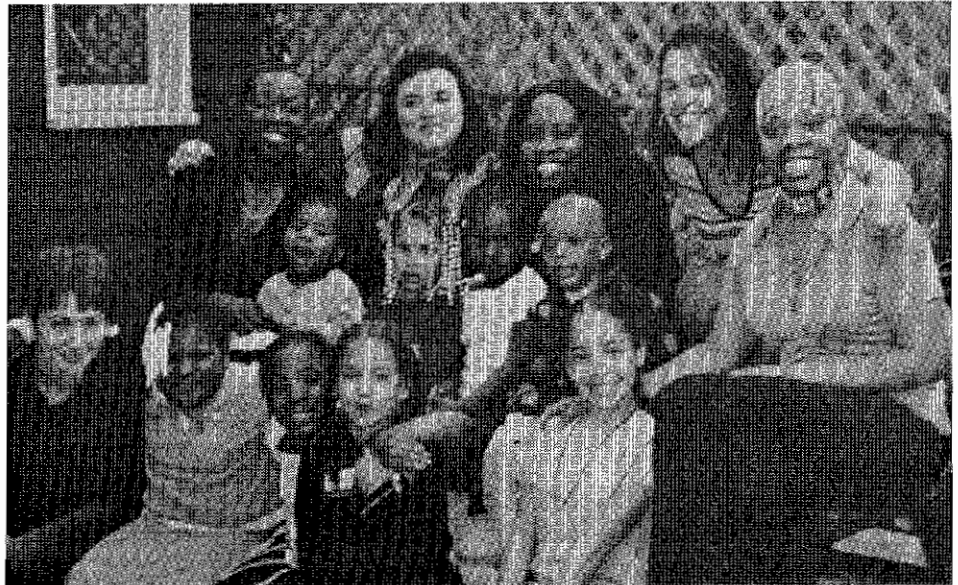
Women of Action members and their children

The Boston Women's Fund will honor Women of Action (WOA) at their seventh annual "Take A Stand" event on Saturday, May 17th. The Fund will acknowledge the work that Women of Action has done to raise awareness of the public transportation and access issues faced by women and children (and others) who use the MBTA. We are very proud! Congratulations Women of Action!