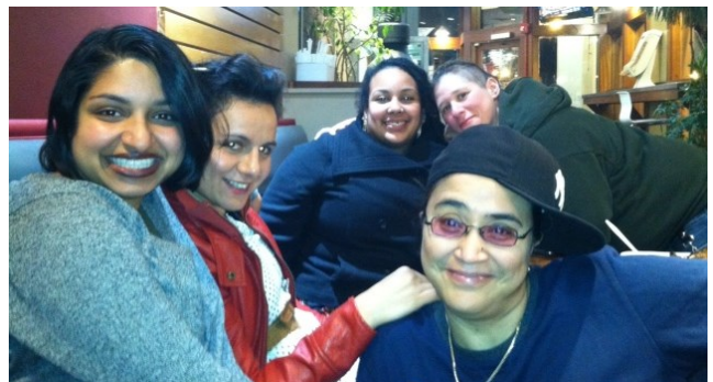
Survivor Theatre Project touring company celebrating after performing at "The Art of Life After," a show bringing forth survivor voices at Makeshift Boston.