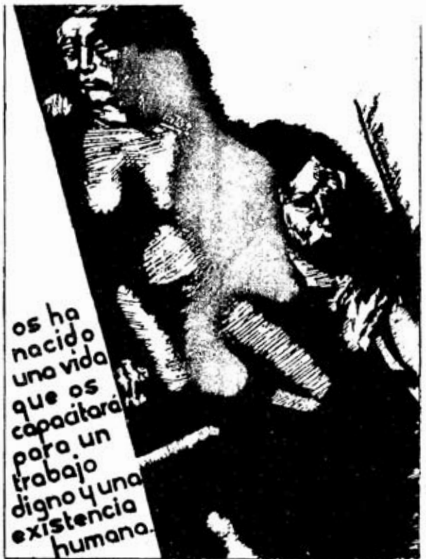
"Every person is born with the capacity for dignified work and a human existence."