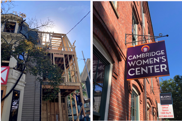
46 Pleasant Street house under construction (left), new sign outside of our temporary Mount Auburn Street location (right).

Thanks to an anonymous donor, our main building is undergoing a complete renovation, which is well underway. We are projected to move back in late 2022 / early 2023. The new building will feature wheelchair accessible bathrooms, an elevator to all four floors, a larger kitchen space and dining area, adaptable community spaces, and much more.