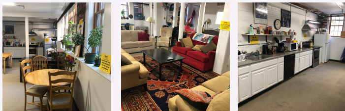
Our temporary drop-in space at 25 Mount Auburn St. Dining area (left), living room (center), and computer / library (right).

On April 19th, we left 46 Pleasant Street, took a left on Mass Ave, and moved into a temporary location at 25 Mount Auburn St. in Harvard Square. The movers who showed up expecting a "routine office move" were met with evidence of 50 years worth of community gathering. Volunteers have been helping us unpack, move furniture, and get settled...it is definitely an ongoing process. Below are some photos in the new space!