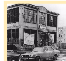
888 Memorial Dr. during the 1971 takeover (above) and from the march (right)

Panel made possible thanks to The 888 Women's History Project and the Cambridge Commission on the Status of Women. Watch the full video online at bit.ly/LOP-2021